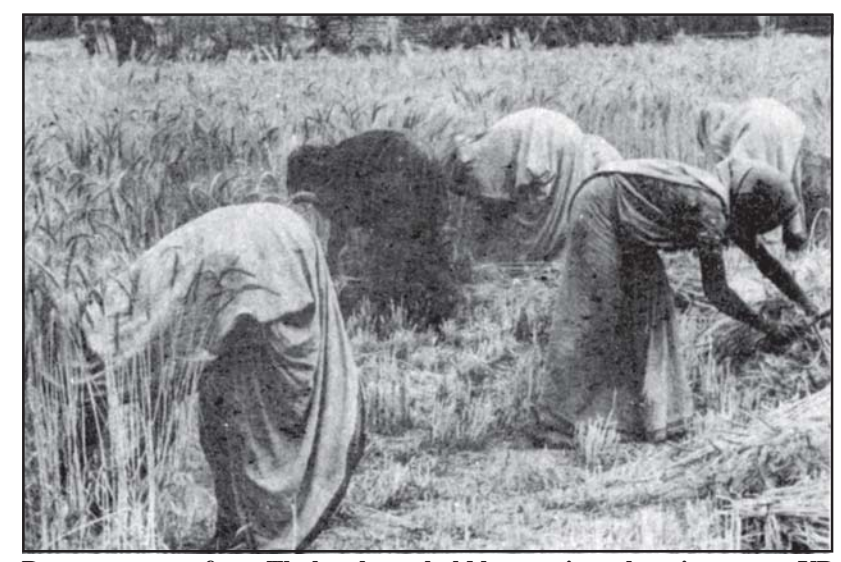
Peasant women from Thakur household harvesting wheat in eastern UP

In the case of wheat, the best estimates of profit per hectare (two and a half acres) does not exceed Rs 2,000 per crop per acre. Thus, the half yearly income for the maximum permissible land holding of 18 acres