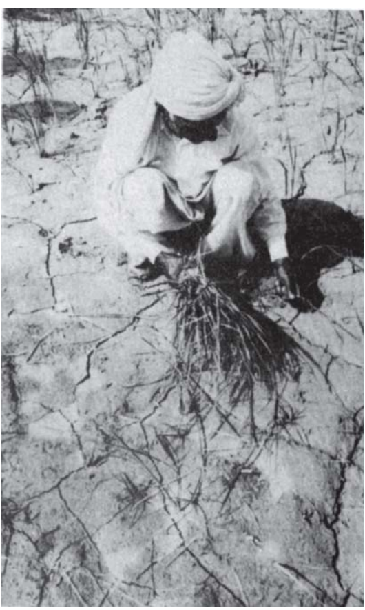
crops. Today, the support/ Farmers suffer from recurring droughts but the sent out under open general procurement prices announced urban population does not starve during periods licence but is subject to a by the CACP have the effect not of crop failure minimum export price. Non-

quotas released in small instalments over the cotton year. In addition, such exports are subject to a minimum export price fixed by the textile commissioner. Thus Indian cotton producers are not allowed to compete freely in the international market This despite the fact that there is a big demand for the new varieties of long