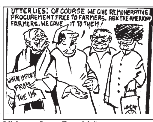
R.K. Laxman, Courtesy Times of India

Scientists don't produce grain. Farmers do. No matter how good the scientific input in devising high yield variety seeds and how successful their lab experiments, if farmers are not enthusiastic about growing foodgrain and are shifting to relatively more lucrative crops, foodgrain production cannot go up.