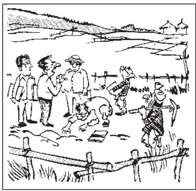
We are all here, Sir—fertilizer supplier, pest controller, seed adviser and soil tester—but I wonder who that man is standing over there!

Today it is only the black moneypossessing urban elite (doctors, lawyers, politicians, bureaucrats and businessmen) who are benefiting from income tax exemption of the farm sector. They invest their ill gotten wealth into buying huge estates and build luxurious palaces of the kind that have mushroomed in Delhi's Sainik Farm area. They escape paying taxes on this by having phoney poultry or dairy farms with five and a half chickens or one and a half cows or a small patch of land set aside for supplying to five-star hotels exotic vegetables such as avocadoes and asparagus, grown by hiring low paid malis. If income tax is introduced in the farm sector, it is these worthies