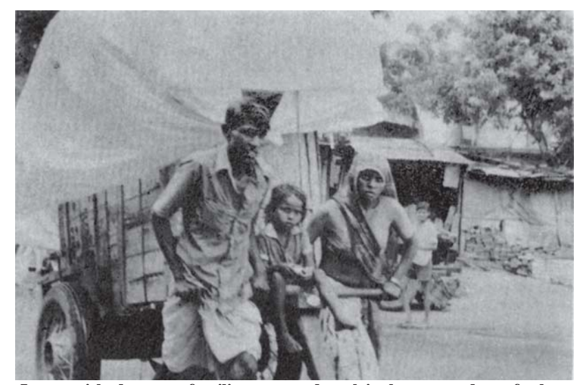
Impoverished peasant families come and work in the most ardous of urban occupations

No country in the world has made economic progress by following policies which inevitably promote pauperisation of its agriculture-based population. The millions who flock to cities to live in slums and work as rickshaw pullers, domestic servants, rag pickers or stone breakers and take on sundry low paid occupations, are economic refugees from our villages, mostly from poor peasant families. Even the sons of so called middle and high income peasants come and work as bus conductors, drivers, peons and