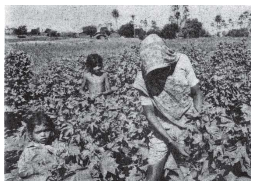
A peasant woman and her children cross pollinating cotton to obtain the hybrid

Our irrigation system also needs substantial expansion and freedom from the bureaucratic stranglehold, farmers ought to be made co-sharers of the local irrigation networks through the issue of water bonds so that they are involved in planning,