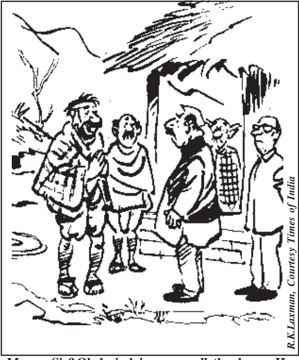
My son, Sir? Oh, he is doing very well, thank you. He is a beggar in Bombay!

In 1951, the ratio between agrarian and non-agrarian incomes was 1:1.4. In the decades after Independence, this gap between rural and urban incomes has increased substantially. In 1988, it was reported to be 1:2.8 at constant prices and 1:6.2 at current prices. The gap is likely to have increased further. Between 1951 and