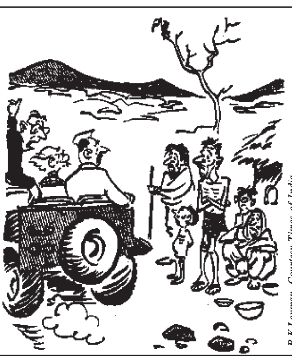
You don't have to promise them anything, Sir. This is not what has been declared as the famine area —it is further up!

Rather than mopping up the agricultural surplus for industrial development in urban centres by following the Soviet model, if our I policy-makers had minimised the obstacles in the way of our farming population, our country's economy would not be in the shambles that it is today. The innovativeness and the enterprise of the Punjab farmer during the late '60s