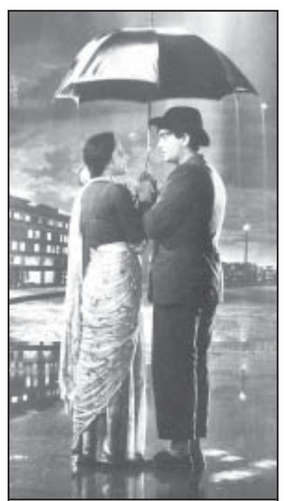
The romantic icons of the 50s: Raj Kapoor and Nargis in Shree 420 .

Yet, it is this moral mantle that is key to understanding Bollywood's appeal for its audiences, despite the low-brow