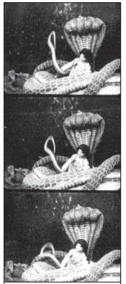
Film as katha : stills from Kaliya Mardan , 1919.

When one travels to Europe, North America or Australia, India (for those few who are at all interested in its existence) is synonymous with poverty, disease,