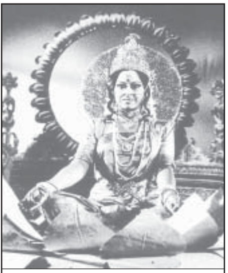
A very human deity: Jai Santoshi Ma, 1975.

Bollywood as the most effective cultural ambassador of India has also kept people reminded that in the Indic worldview there is no sharp dividing line between the human and the divine. God is not a distant entity who sits somewhere above in Heaven, giving orders and commandments, expecting unconditional obedience, doling out rewards for obedience and punishments for those who dare work