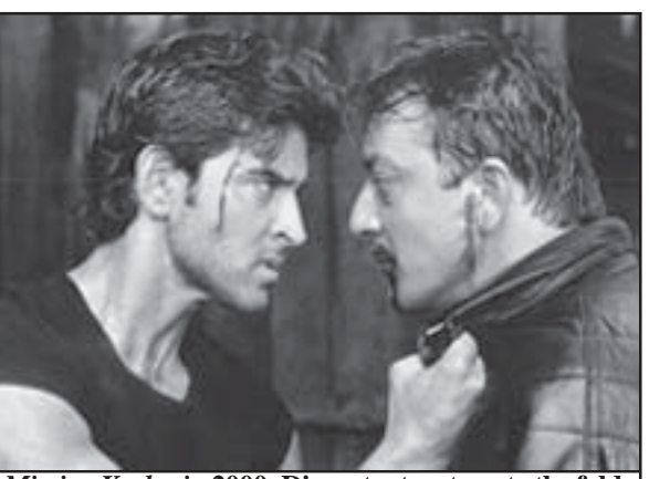
Mission Kashmir , 2000: Discontents return to the fold in a sympathetic portrayal of terrorism.

inadvertently killed by her own husband. When her adopted son becomes a terrorist to avenge the death of his parents, she does not stop loving him. She is killed by a bomb meant for her husband and planted by her adopted son, underscoring the theme that terrorism is not the right path for redressing political wrongs, that the politics of hate destroys not just the targets of hate but also those who act out of hate. The boy finally joins hands with his adoptive father to save his homeland Kashmir when he realises that his terrorist colleagues were planning to blow up an important